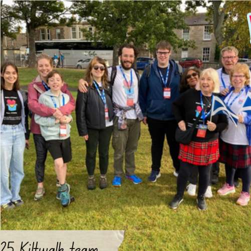
Our 2025 Kiltwalk team