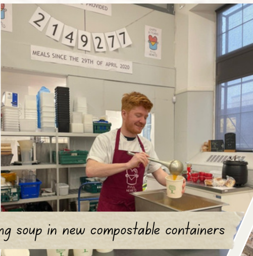
Serving soup in new compostable containers