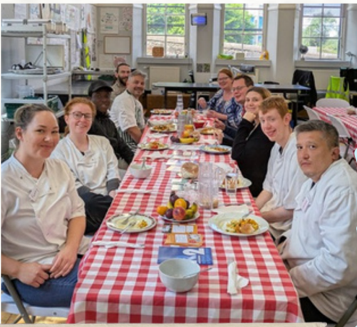
Volunteers before a busy community lunch!