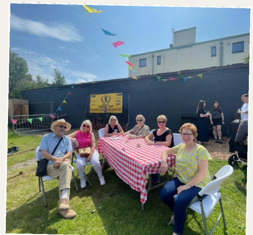
Our Summer BBQ - for local people, service users, volunteers and supporters!