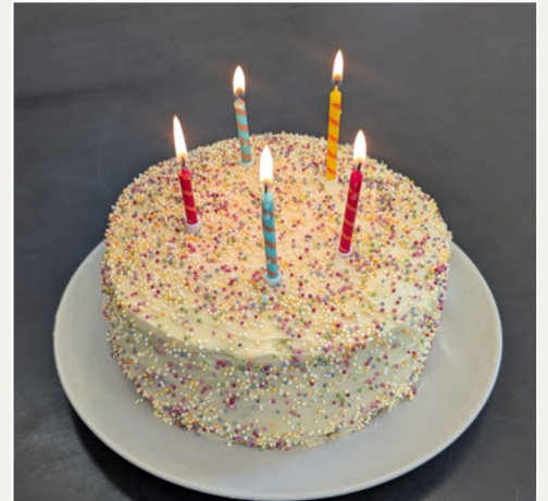
Our 5 year anniversary