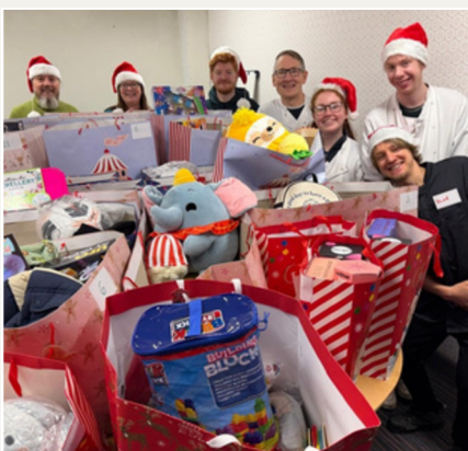
Delivering Christmas presents alongside meal packs to families, thanks to Cash for Kids